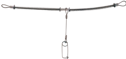
WB1C - WB1 with safety clip and lanyard