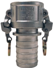
female coupler x hose shank