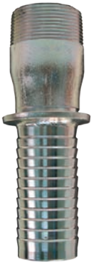
male NPT x hose shank