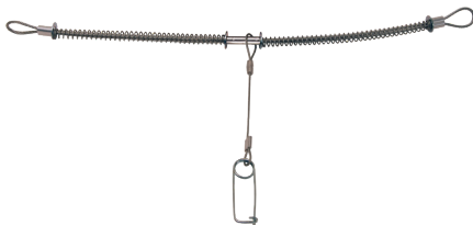
WB1C - WB1 with safety clip and lanyard