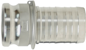
316 investment cast stainless

Only use the crimp style shanks with the crimp style sleeves and ferrules. Due to differences in dimensions and tolerances for safety reasons, do not interchange other manufacturers' products with Dixon® products. Pressure rating is based on the seal of the mating part. See ratings on page 20.