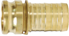
C38000 forged brass