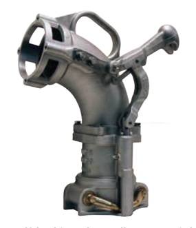
self-locking drop elbow - no inlet