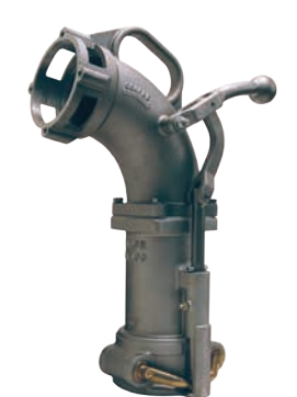
drop elbow with side lever without inlet connection