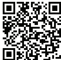
Scan to download DBR413