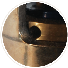
uses 3/8" rod: <30lbs required to adjust

For additional information please call Dixon Fire at 877-712-6179.